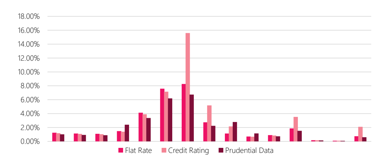
Figure 4 Annual levy amount as a percentage of annual profit (banks)

The impact on banks' profitability, as shown in Figure 4, is generally not significant even if the cost is fully absorbed by firms' profits. Two banks' profits will be affected larger than 5%.