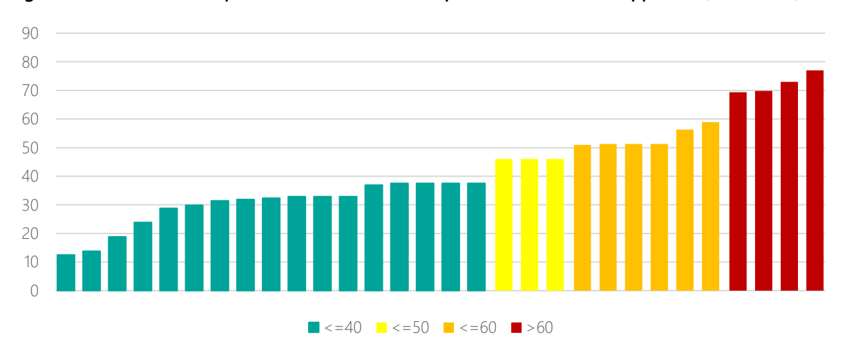
Figure 1 Distribution of deposit takers under the composite risk indicators approach (risk scores)

Applying the risk scoring system calculated on the proposed risk matrices to deposit takers would result in the following distribution (as shown in Figure 1) across four different risk buckets. In the chart below, we have anonymised each deposit taker.