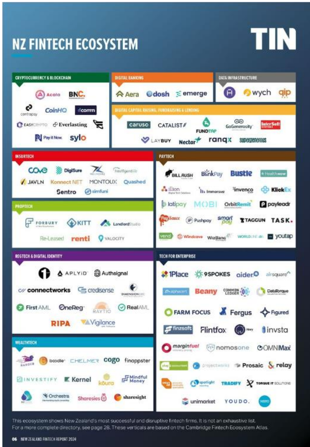
Figure 2: TIN infographic of fintechs in New Zealand