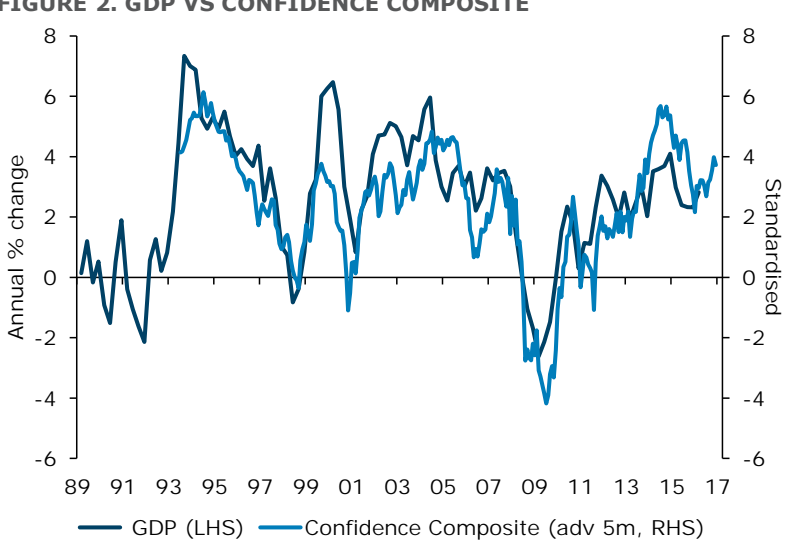
FIGURE 2. GDP VS CONFIDENCE COMPOSITE

The economy is caught between adagio and allégro. Our confidence composite gauge (which combines business and consumer sentiment into one gauge) continues to flag a solid-to-strong pace of GDP growth over the coming months. Three to four percent real GDP growth is on offer. That would mark the sixth year of economic expansion. It's looking like an allongé economic cycle.