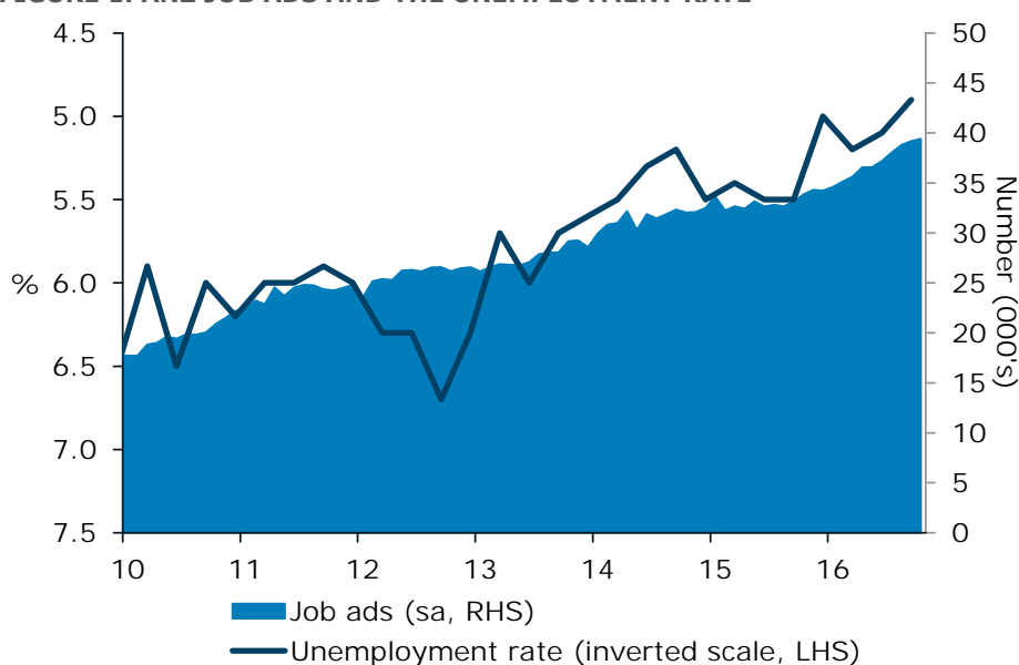
FIGURE 1. ANZ JOB ADS AND THE UNEMPLOYMENT RATE

Source: ANZ, Statistics NZ, Seek, Trade Me